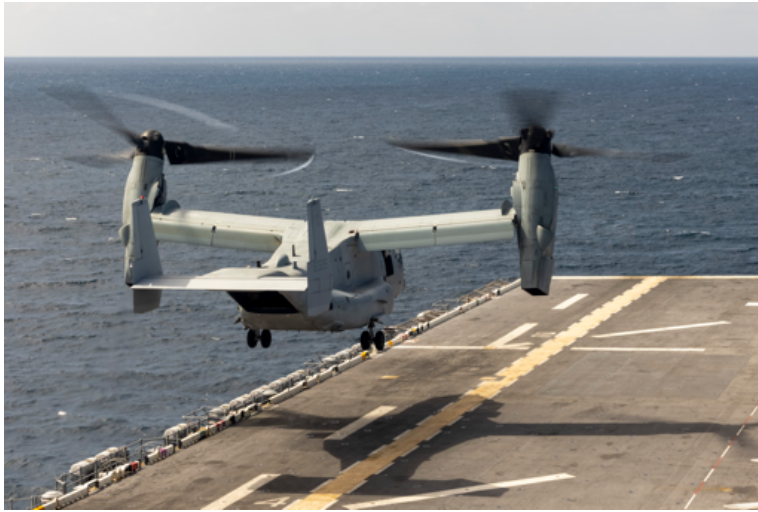
ATLANTIC OCEAN 24th Marine Expeditionary Unit 06.09.2024

A U.S. Marine Corps MV-22B Osprey tiltrotor aircraft with Marine Medium Tiltrotor Squadron 365 (Reinforced), 24th Marine Expeditionary Unit (MEU) Special Operations Capable (SOC), takes off from the amphibious assault ship USS Wasp (LHD 1) to establish a forward base of operations in Sweden during Baltic Operations (BALTOPS) 24 while underway in the Atlantic Ocean, June 9, 2024. BALTOPS 24 is the premier maritime-focused exercise in the Baltic Region. The exercise, led by U.S. Naval Forces Europe-Africa and Executed by Naval Striking and Support Forces NATO, provides a unique training opportunity to strengthen combined response capabilities critical to preserving freedom of navigation and security in the Baltic Sea.